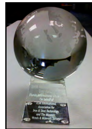
Showcase of some of MA-FIU “World Materials Day” awards.